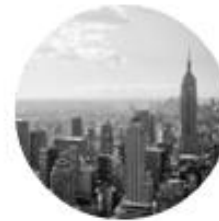
NEW YORK United States